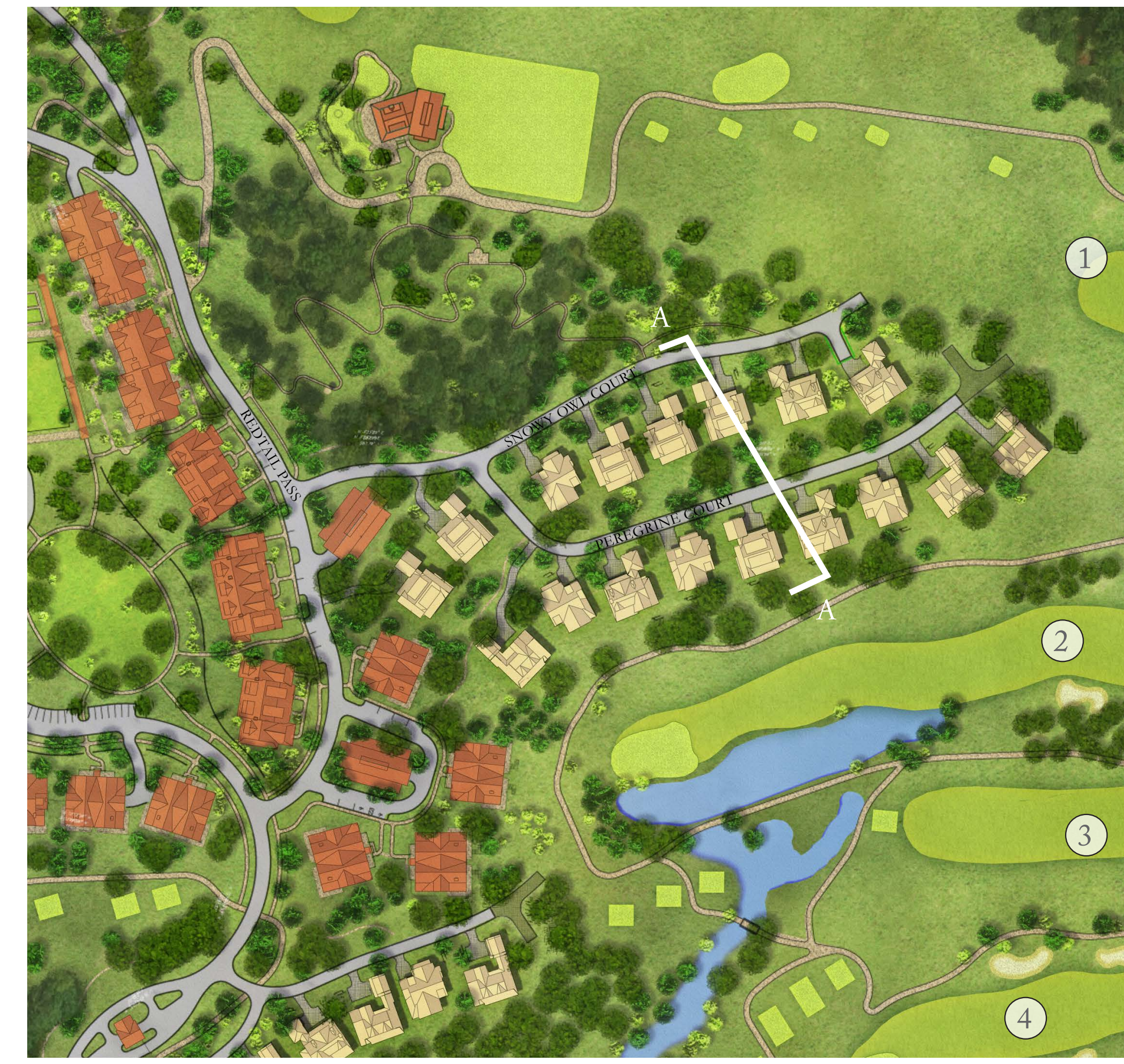
KEY PLAN (NOT TO SCALE)